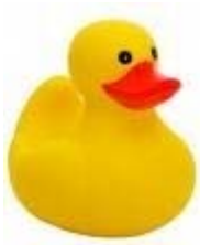
(a naked duck)

The session missed must be agreed with the squad coach beforehand.